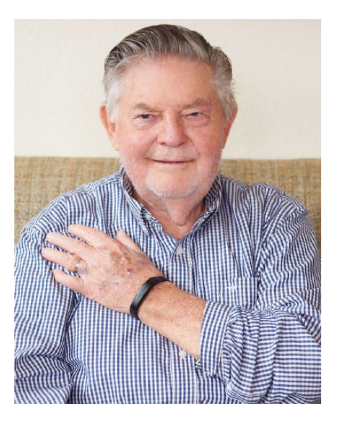
Figure 4. A user wearing a fitness tracker device without a display on the band. This device relies on connection to a smart device, which would be easier to view and interact with when need be.

Overall, designing for changes in visual acuity represents a formidable challenge, and developing novel ways of providing information to older adult users that can be deciphered without perfect visual function is likely to be a worthwhile endeavor moving forward.