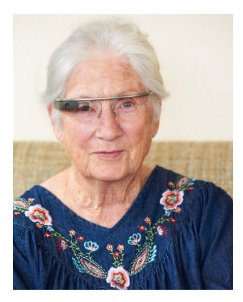
Figure 3. User wearing Google Glass and contacts.

by design or by necessity, visual information tends to be presented in the smallest way possible to minimize the size and weight of the device. For example, a smart watch designed to be lightweight and comfortable requires a relatively small display, one that could be difficult for older adults to read with ease. Fisk et al. (2009) recommended that a four-letter word should be roughly the width of a thumb when the arm is extended (visual angle of 0.6°), which may be hard to achieve on small wearable devices.